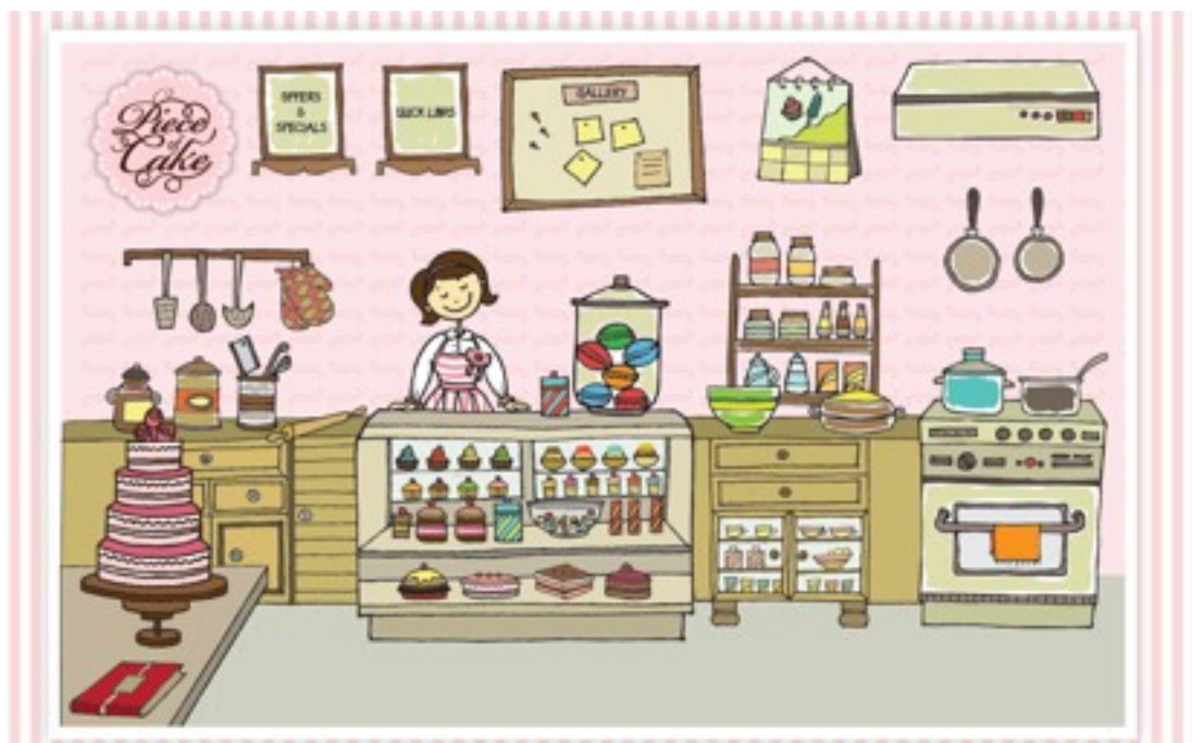
Cost of design and development of Piece of Cake website - AED 18,000/-